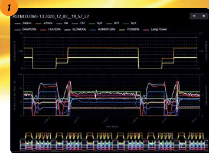
Figure 1: Archived test data can also be downloaded and analyzed within the WXView II application. Critical control system information can be reviewed and shown or hidden with the click of a button.