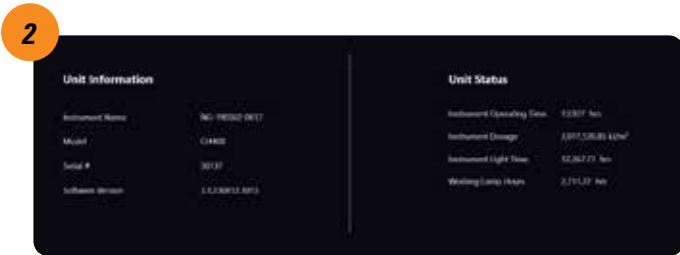
Figure 2: Shows general instrument information, including User Interface software version, operating time, and current working xenon-arc lamp hours.