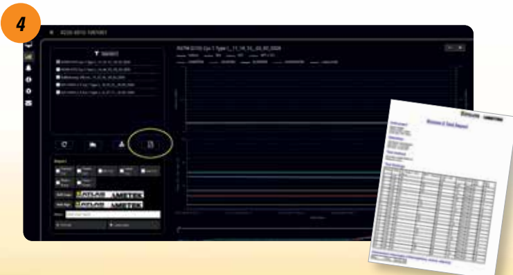
Figure 4: Generate audit ready PDF reports from archived tests to support ICH compliance, regulatory reporting, and long term record retention. Reports can be customized with your company logo and authorized signatures.